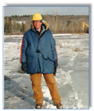
Pipeline Repair Red Deer River